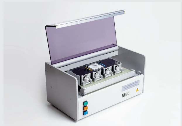
General purpose high voltage test fixture GPTF

The General Purpose Test Fixture, GPTF is available for use with the RT900 where a turn-key high voltage adaptor solution is required featuring mechanical and electrical operator safety interlock mechanisms. Please contact ART for more information.